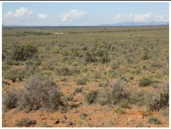
General_natural veg on site 2