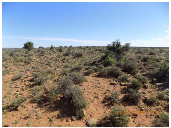
General_natural veg on site 4