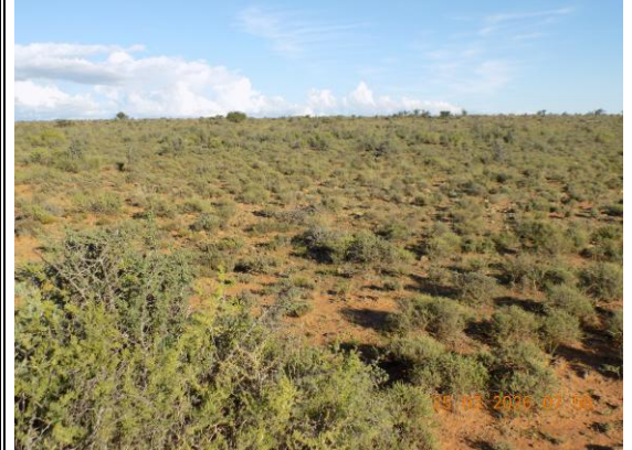
General_natural veg on site 5