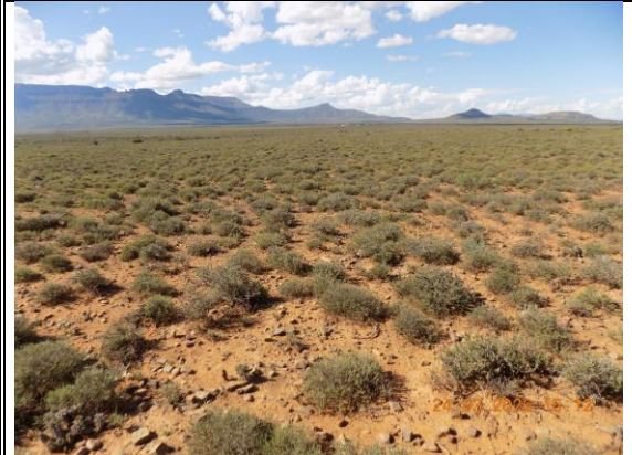
General_natural veg on site 3