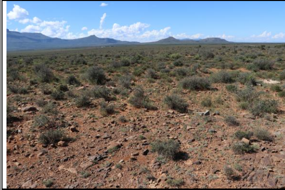
General_natural veg on site 1