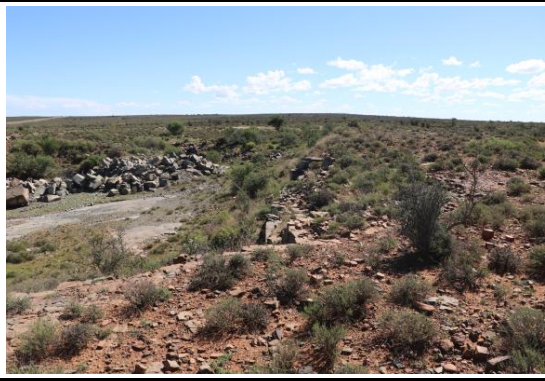
Access road from site looking SE towards R61